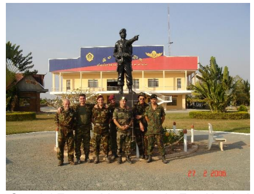
Special Forces Monument in Fort Kombol