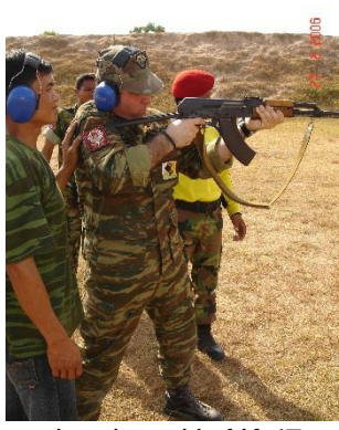
shooting with AK-47