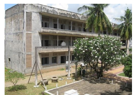
Khmer Rouge S21 Torture prison and Killing Fields