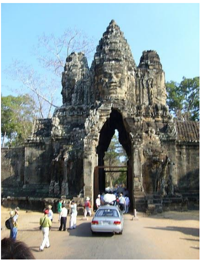
During the add on: Antic city and temples of Angkor