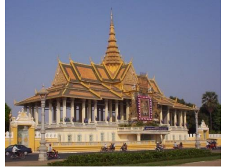
King palace in Phnom Penh