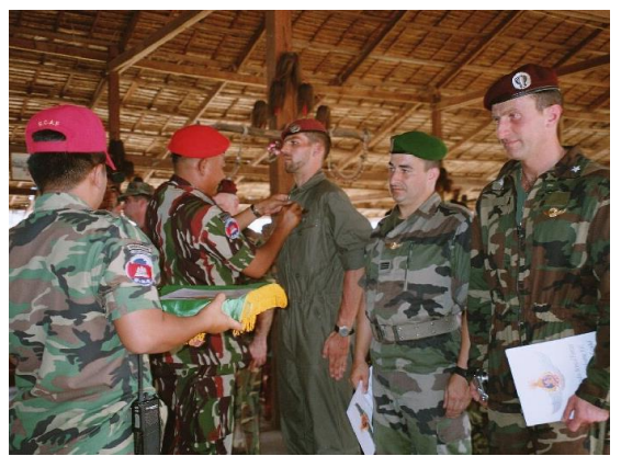
awarding ceremony leaded by the commanding general