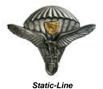
Slovakian and Turkish Army: