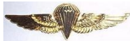
US Navy (to be confirmed)