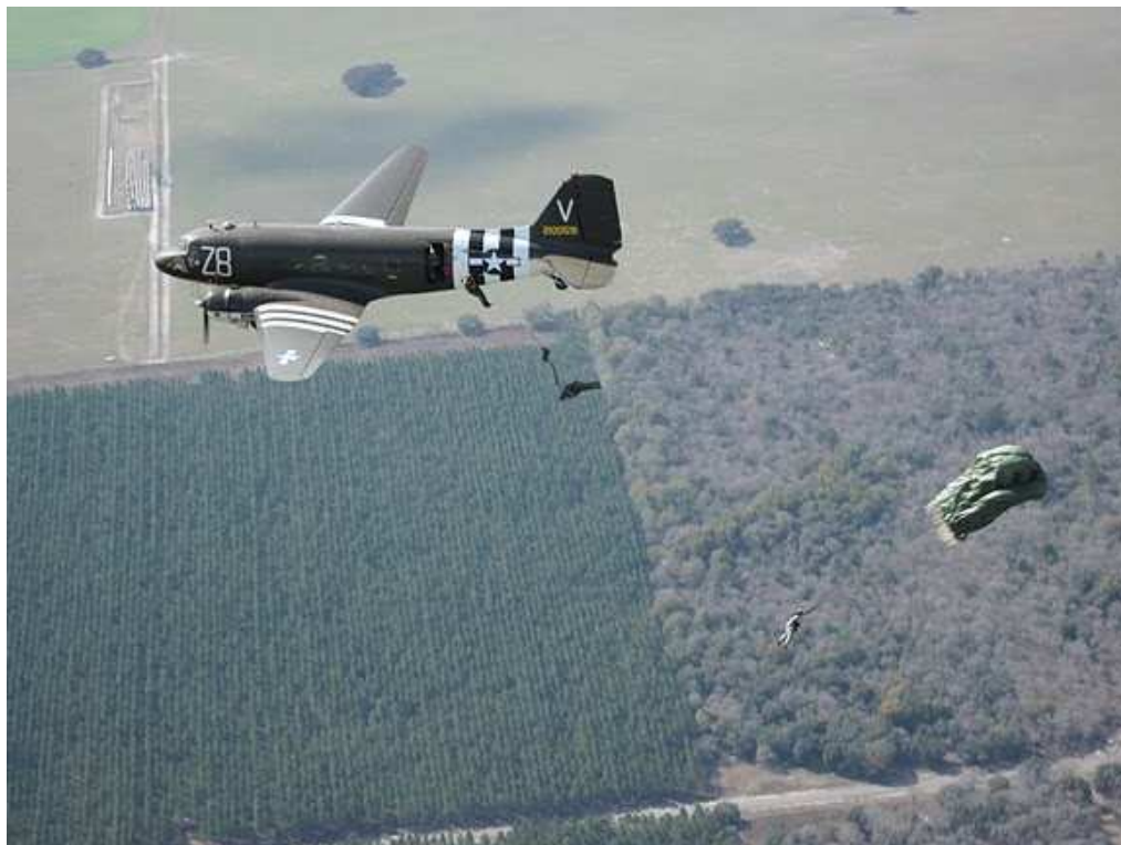
Our jump-ship C-47 Dakota "Tico Bell" in WW2 colours during Op Screaming Eagle 2011

Jump-ship: C-47 Dakota that actually flew on D-Day, in original WW2 colors (in case of the Dakota cannot fly we will get a Skyvan which provides tail gate exits) and Cessna 180 for training our students