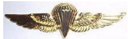
US US Navy (to be confirmed)